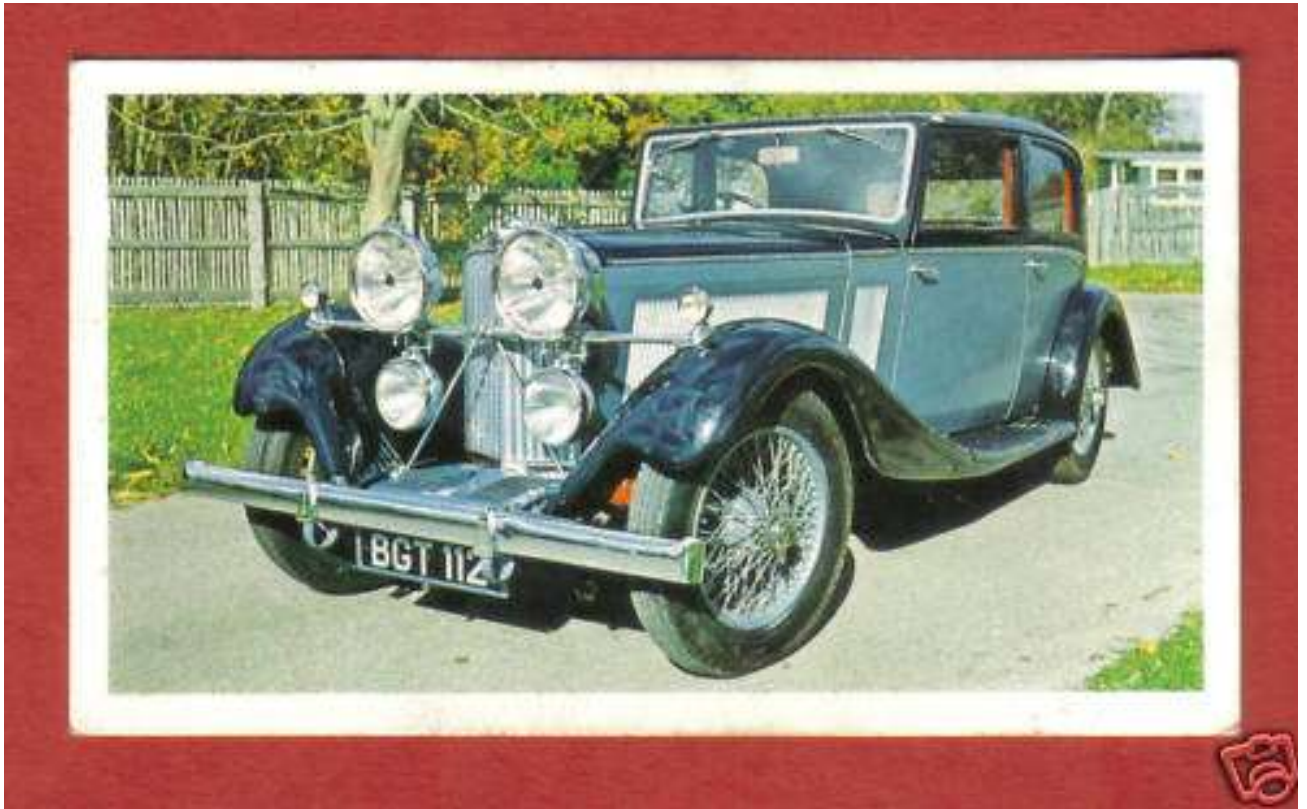
A 1934 Talbot (but not the Lancefield Body)

Some of us in olden times had preselectors.