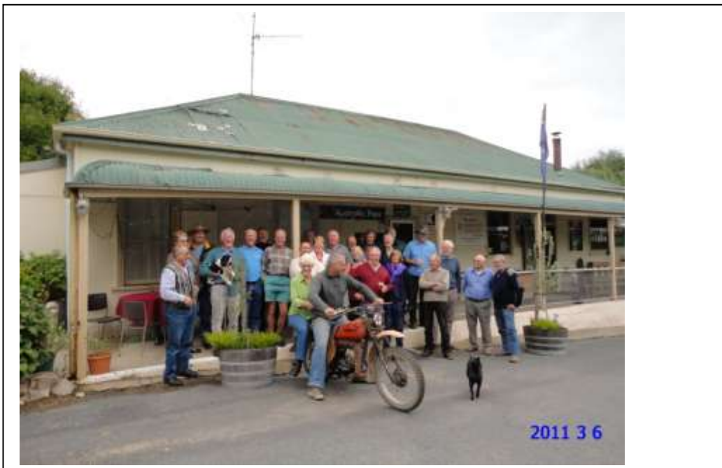
At the Elrington, Majors Creek

Monday 4 th April. Moruya Bowling Club at 7:30 pm