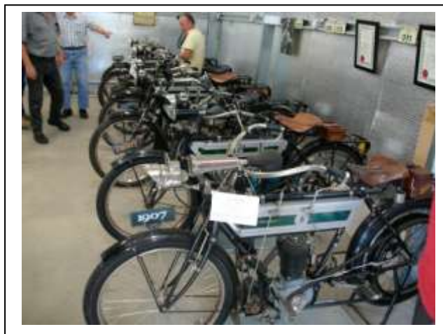
Visit to Dignams Creek