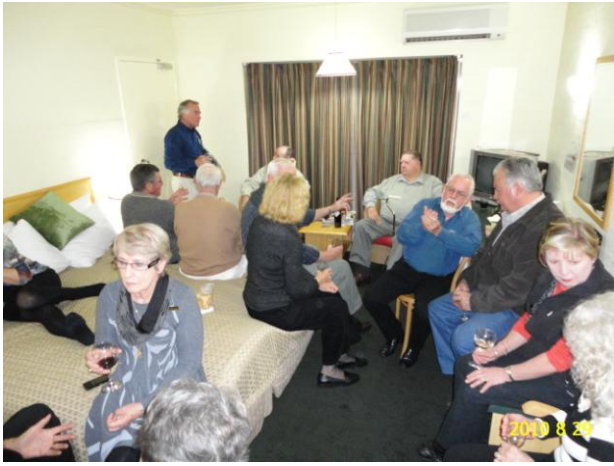
Did they all share one room???