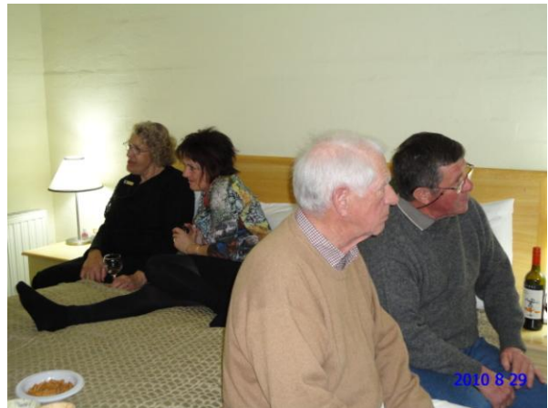
and women in another!