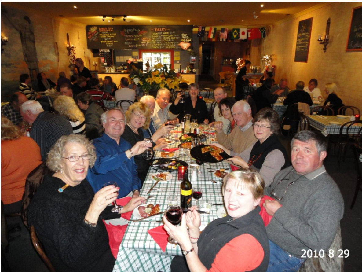
And a good time was had by all